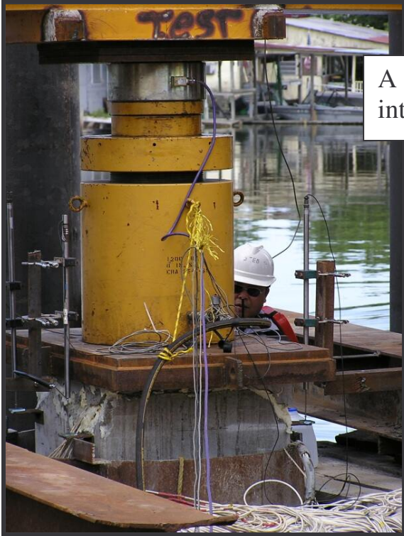
A 1200 ton jack being set into place to test piling.