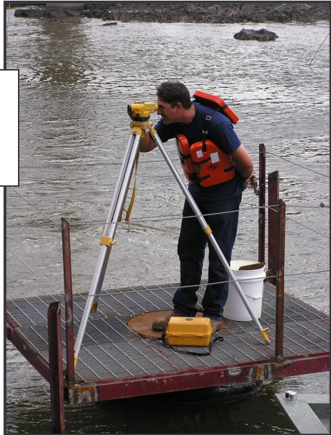
Careful survey control is required to measure pile deflections during the test.