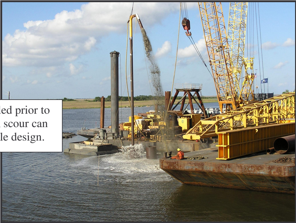
Special casings are installed prior to the load test so that storm scour can be accounted for in the pile design.