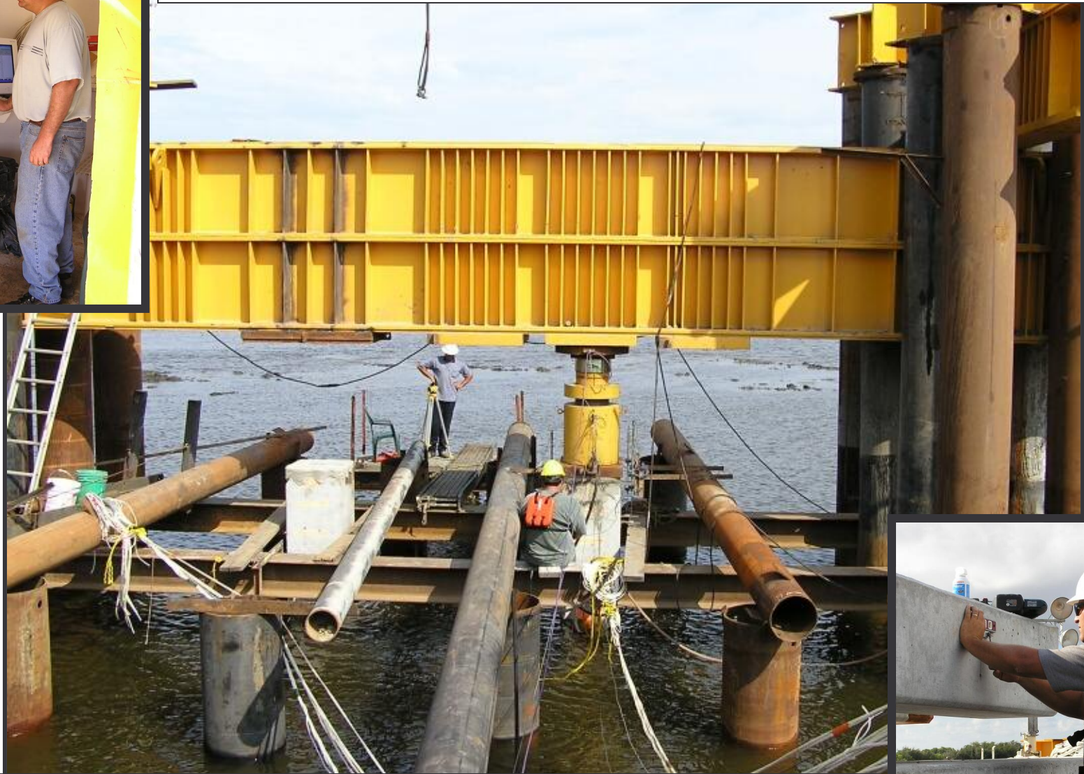
Figure 1 Inspector monitoring data during one of the test pile loading sequences.