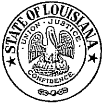
BOBBY JINDAL GOVERNOR