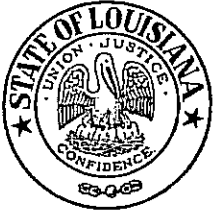
BOBBY JINDAL GOVERNOR

P.O. Box 94245 Baton Rouge, Louisiana 70804-9245 www.dotd.la.gov 225-379-1485