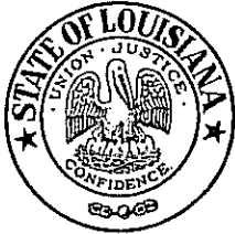
BOBBY JINDAL GOVERNOR

P.O. Box 94245 Baton Rouge, Louisiana 70804-9245 www.dotd.la.gov 225-379-1485