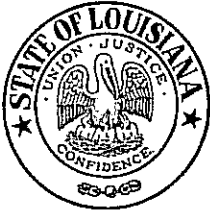
BOBBY JINDAL GOVERNOR