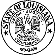
BOBBY JINDAL GOVERNOR

P.O. Box 94245 Baton Rouge, Louisiana 70804-9245