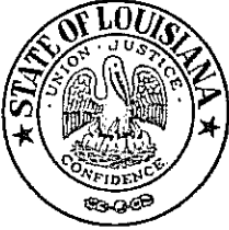
BOBBY JINDAL GOVERNOR