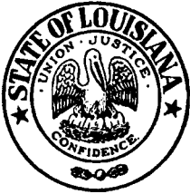
BOBBY JINDAL GOVERNOR

P.O. Box 94245 Baton Rouge, Louisiana 70804-9245 www.dotd.la.gov (225) 379-1947